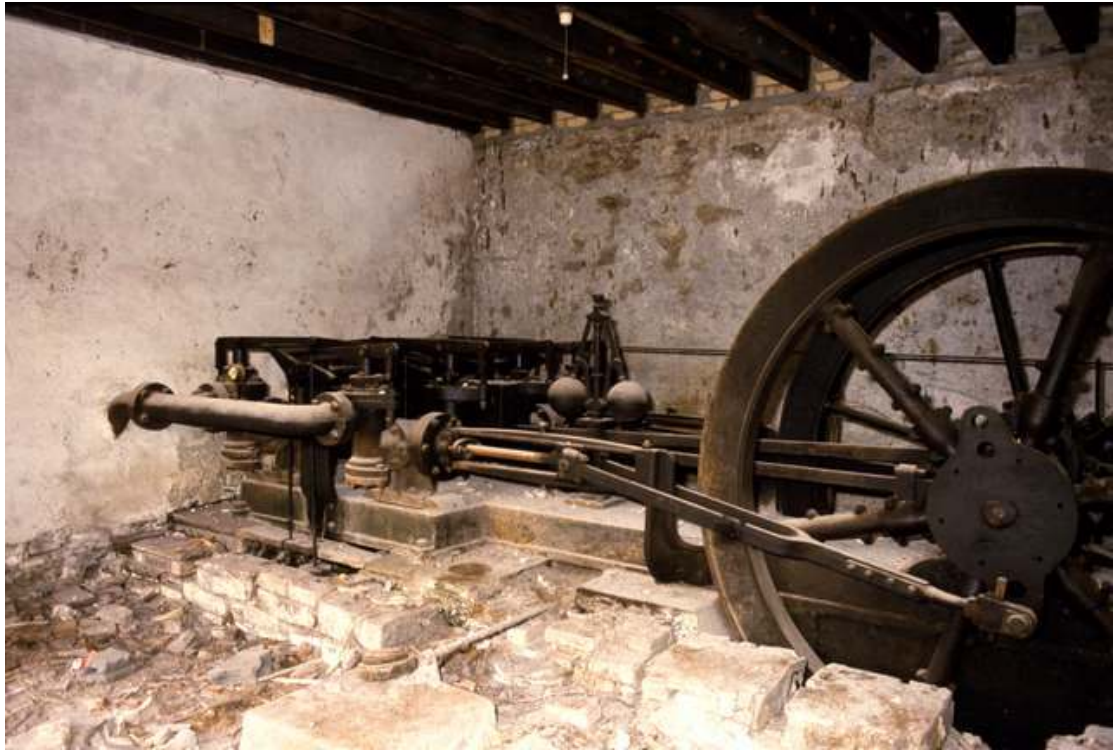
The sawmill engine in situ circa 1986.