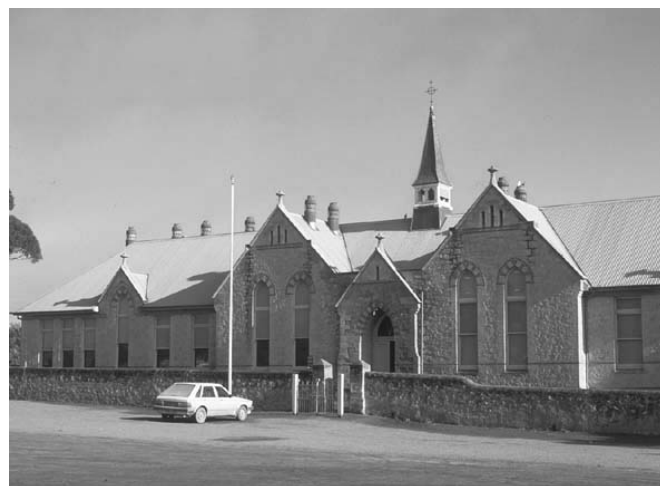
Moonta Mines Museum

Inspection of other mines in the Moonta district will be arranged for Monday July 10 if there is sufficient interest.