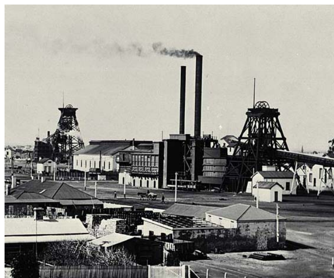
Wallaroo Mine, 1915