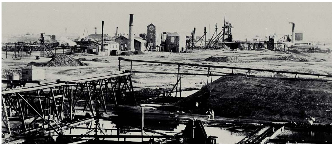
Elders Lode, Moonta Mine, 1898

The next annual conference of the Australian Mining History Association will be held at Kadina in South Australia's Copper Triangle from 5-9 July 2006. The historic copper towns of Moonta, Kadina and Wallaroo form what is known as the Copper Triangle. Copper was first discovered in the area in 1859 by a shepherd which caused a rush for mining leases. This led to the establishment of the Wallaroo (at Kadina) and Moonta Mines which worked from 1860 until 1923 and formed one of the largest copper producing areas in the world in the late 19 th century.