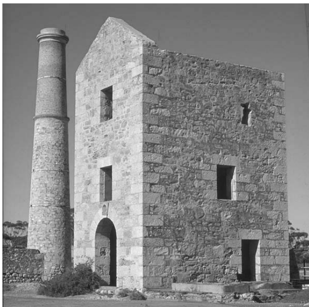
Hughes Enginehouse, Moonta Mine

A bus tour will give an overview of the history and development of Kadina and the coastal town of Wallaroo, which was once the site of the largest copper smelter outside Wales. It will include the smelter site and the Heritage and Nautical Museum.