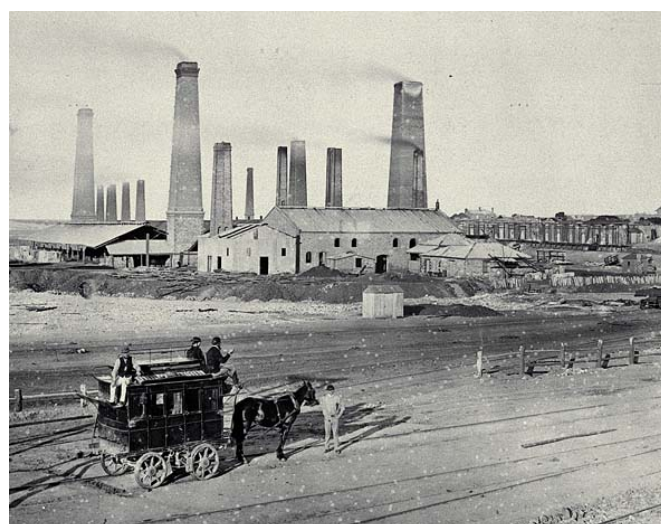
Wallaroo Smelting Works, 1870