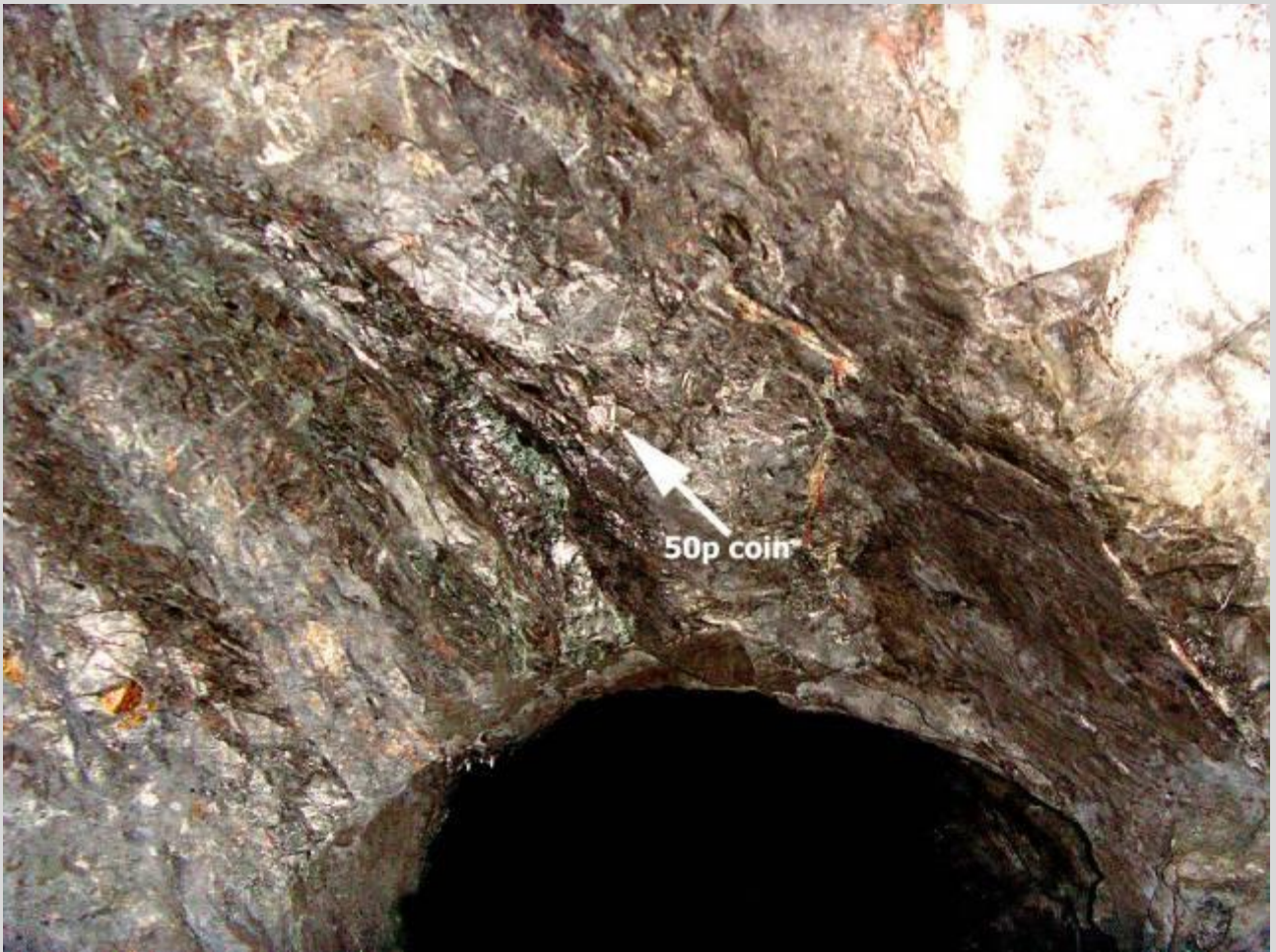
Late graphite-chlorite veins: Silver metallic lustre of graphite and chlorite clearly visible.