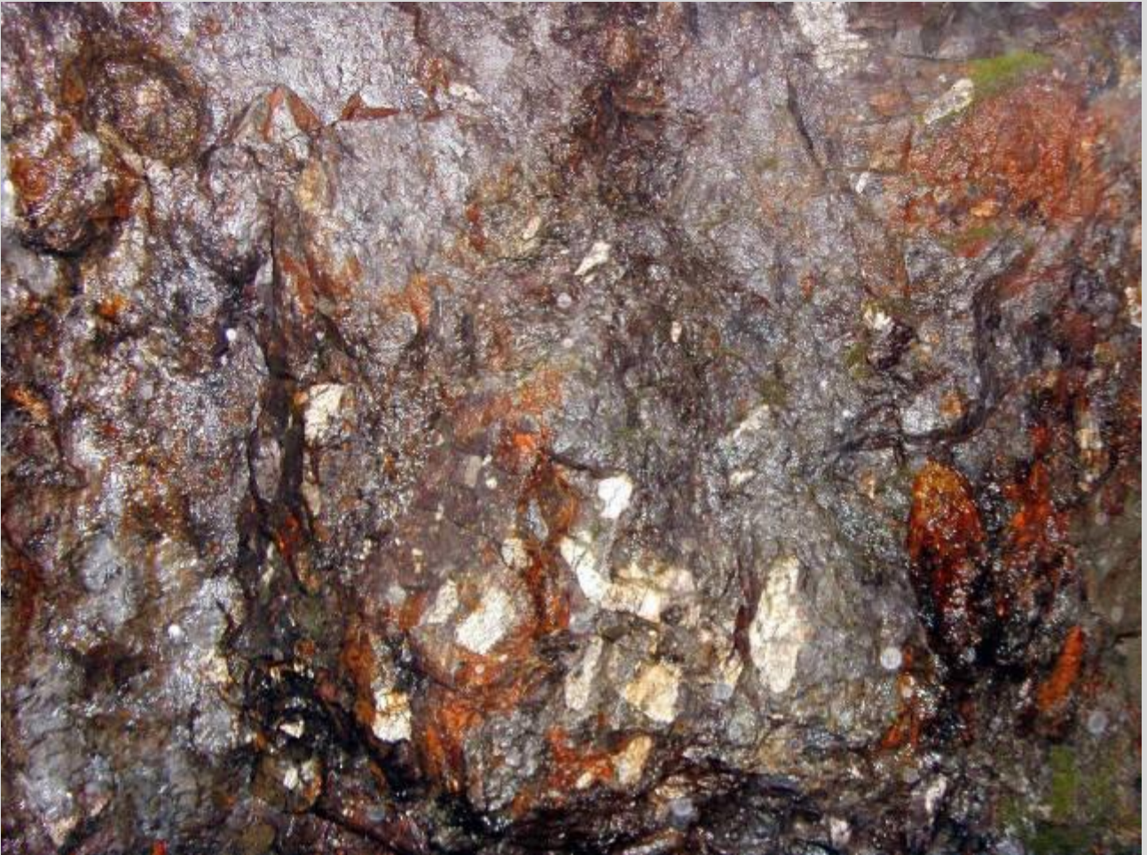
Within the Grand Pipe: white fragmented quartz evident, as is brecciation of the host volcanic rock.