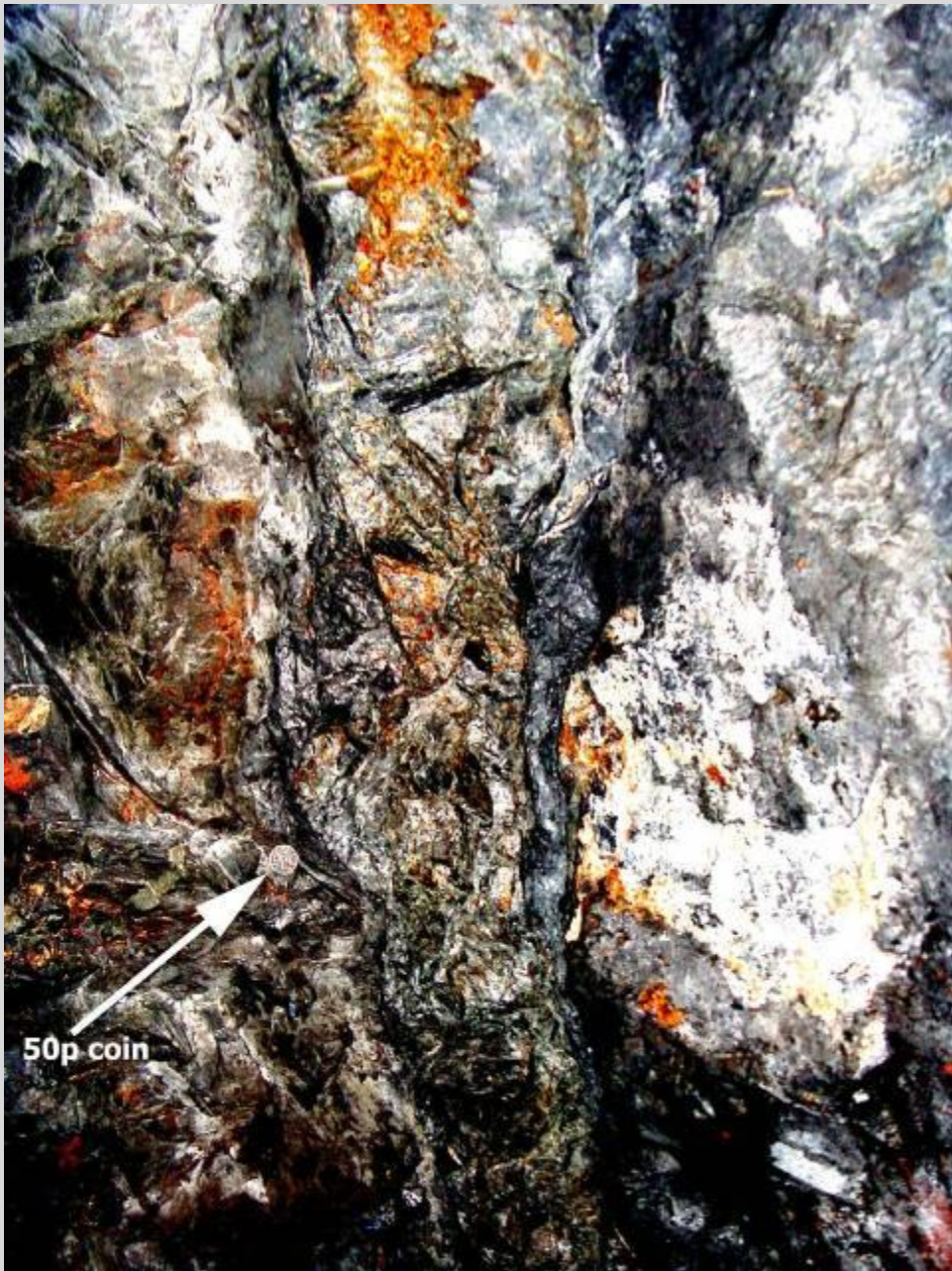
Late graphite-chlorite vein: Many features visible in this vein