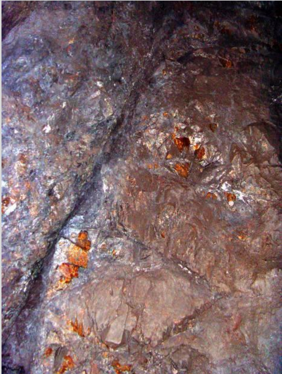
Same vein: Note the continuation and “nipping in” of the vein/fault