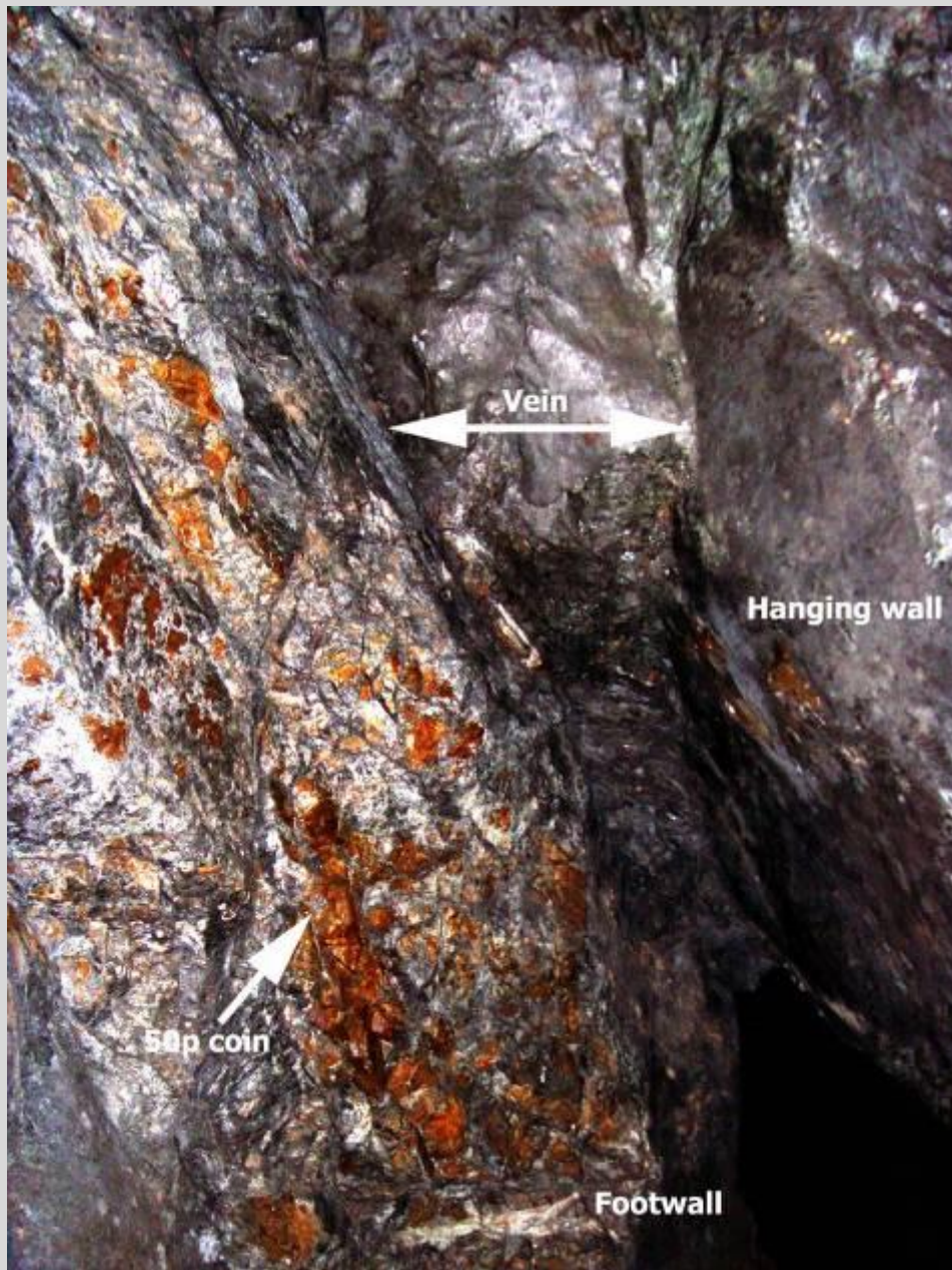
Late graphite-chlorite vein: note fragmented quartz (white/brown) in the footwall.