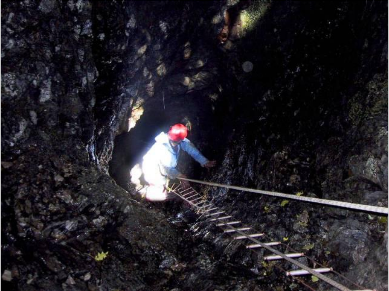
Dave Millward descending the Grand Pipe lit up in a shaft of brilliant sunlight. Note brecciated wall rock: see following report.