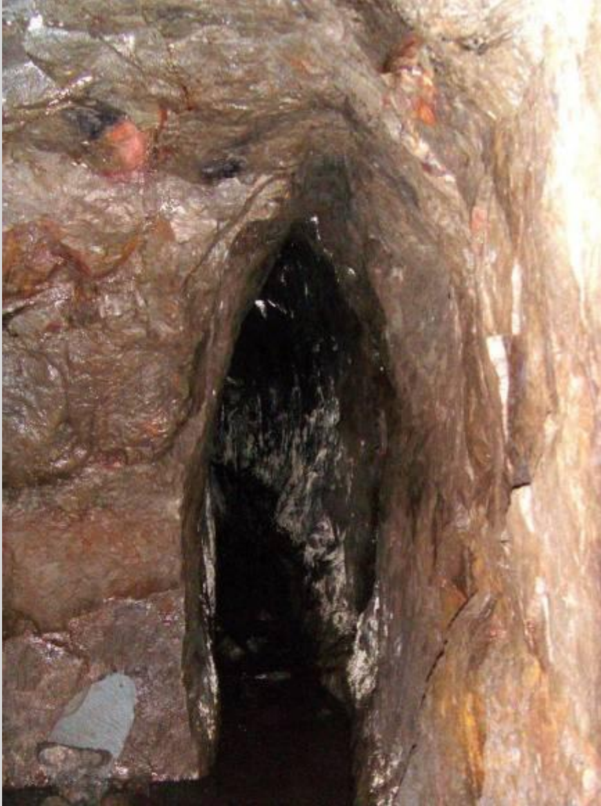
The classic "hand-driven" coffin level in Old Men's Stage circa 1625