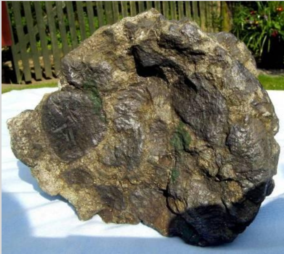
Sample: graphite nodules have replaced the original minerals in the much altered volcanic rock; width 15cm.