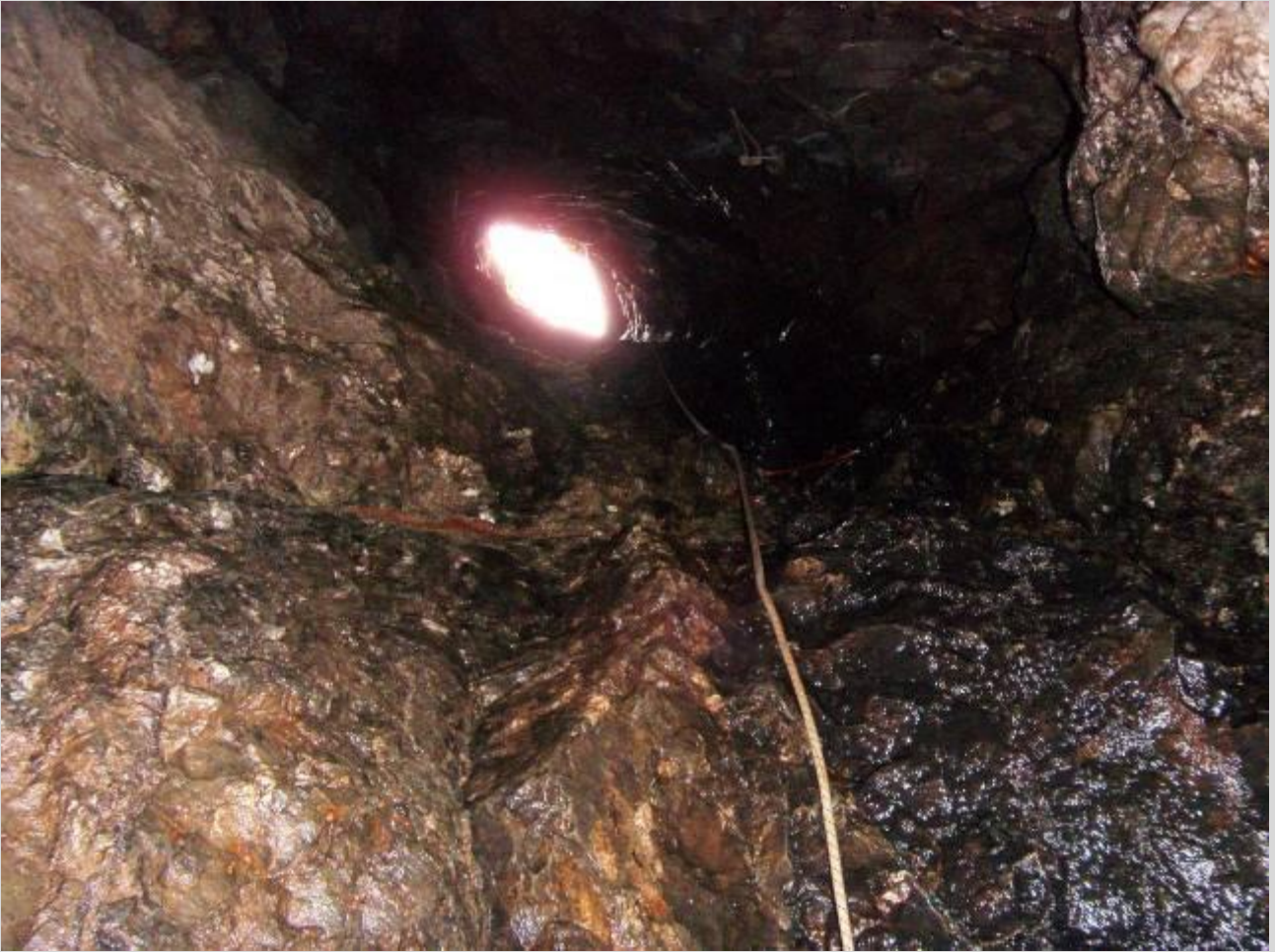
Looking 100 ft up the Grand Pipe from Old Men's Stage to the surface. Note fragmented quartz and brecciated wall rock of the pipe: see following report.