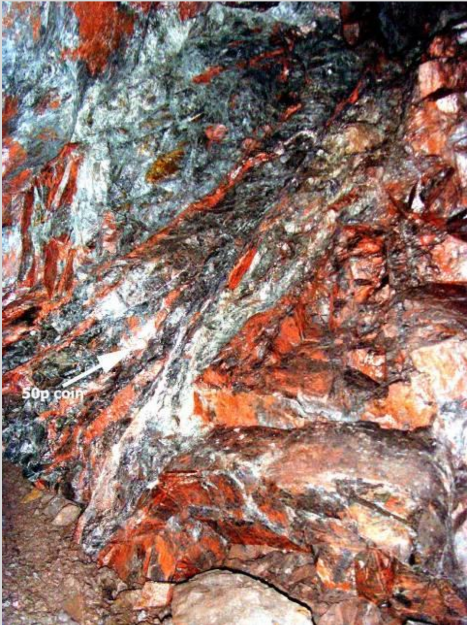
Iron staining in this heavily excavated area: