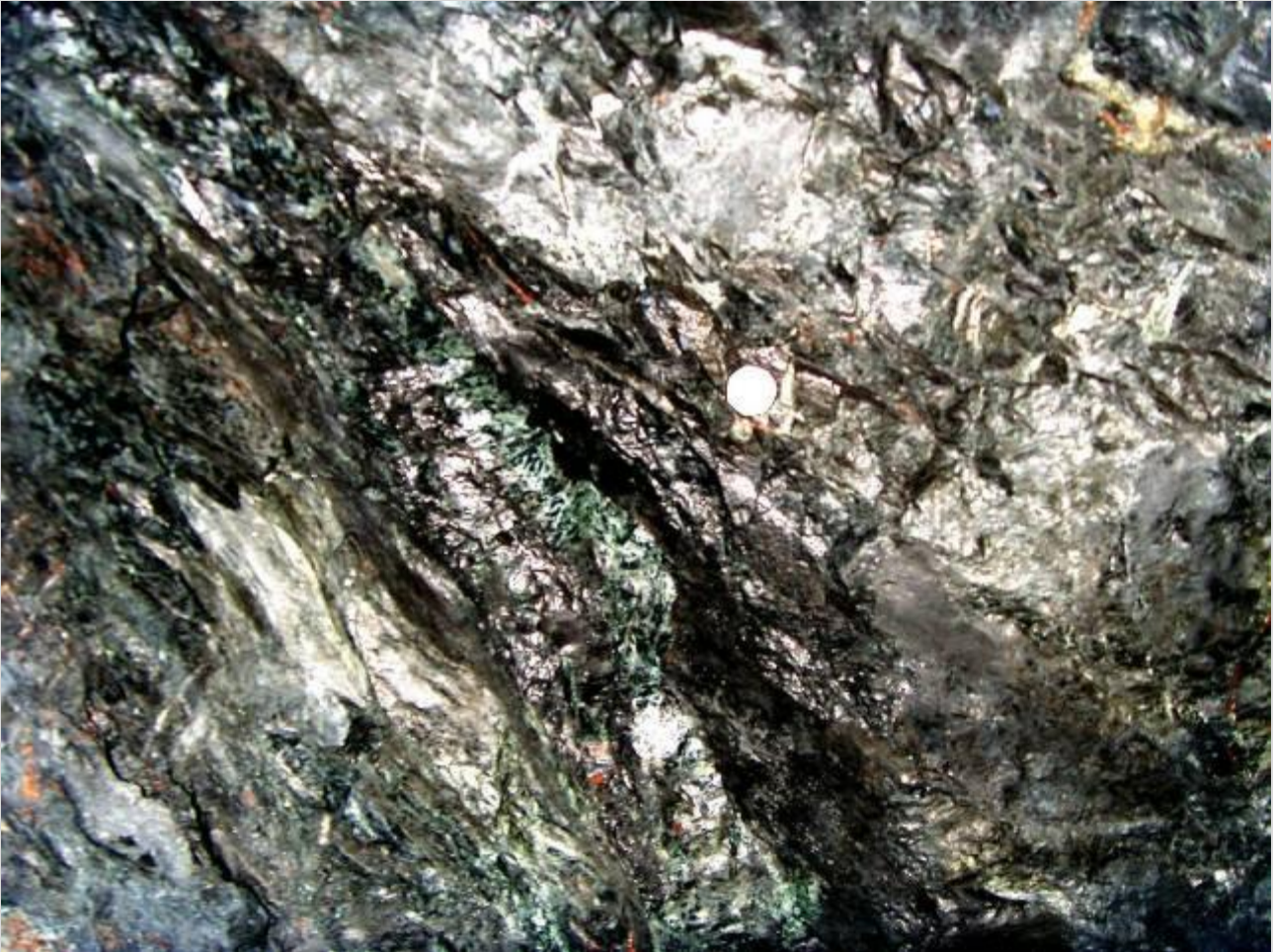
Close up of the above picture