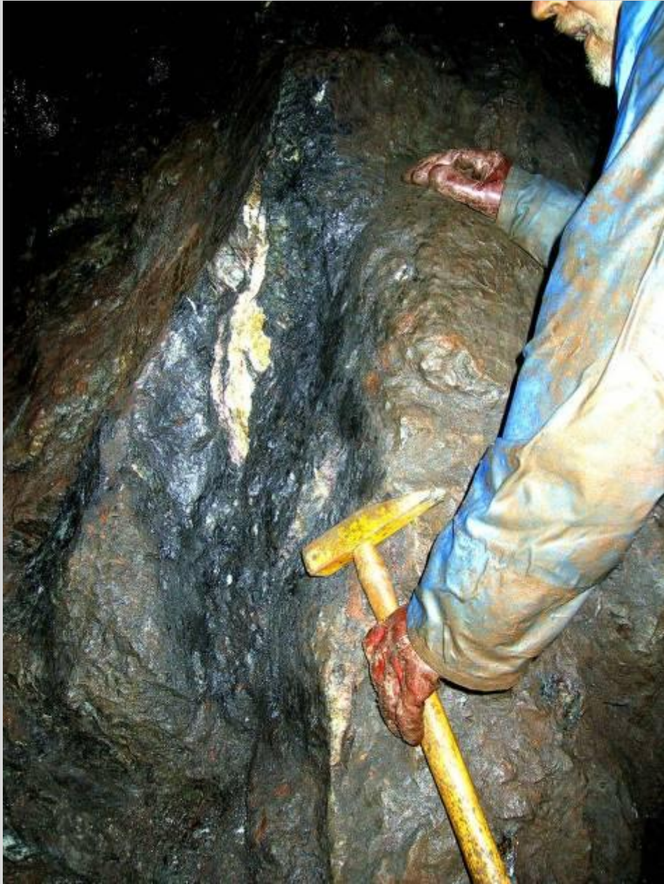
Extensive graphite deposit.